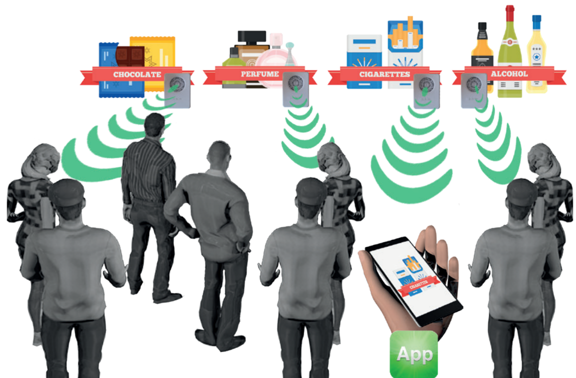
pointer triggers the specific space in the database and initiates the content's appearance on the screen