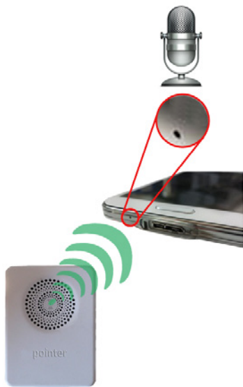
pointer reaches the microphone input of the smartphone